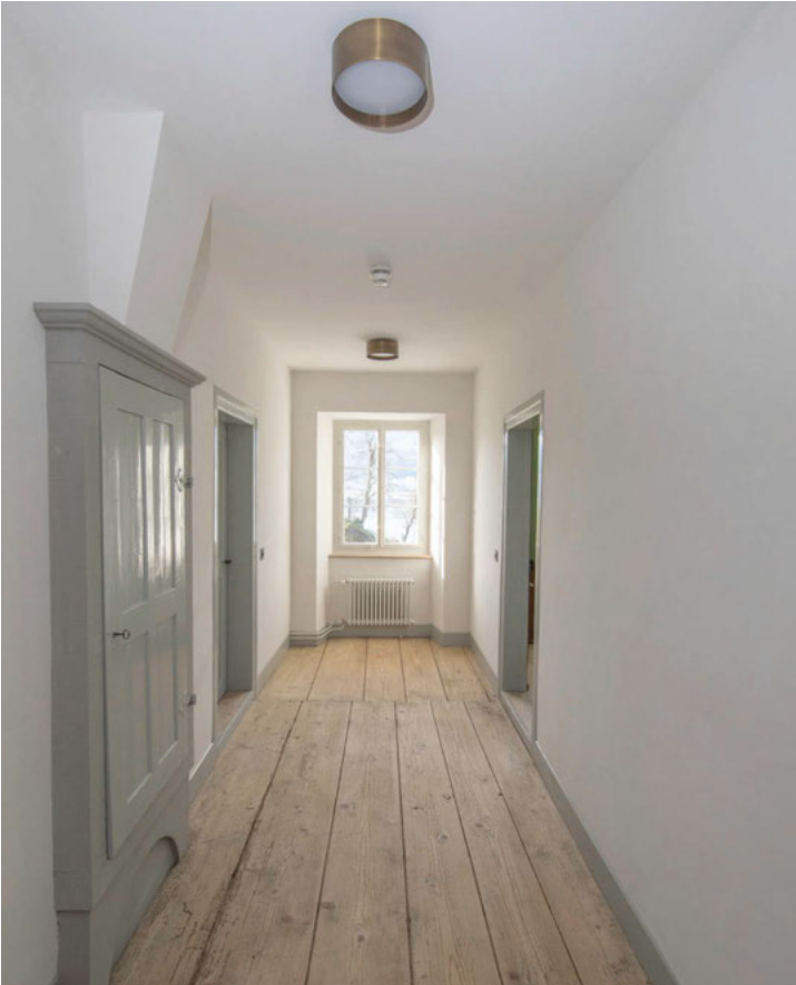
The tenant residence is on the first floor. The PUNTO lamps in their fine housing were used here as well.