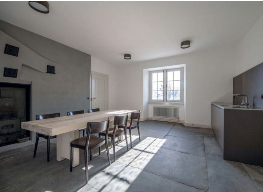
The old stone floor of the large tenant apartment kitchen shows the building's long history.